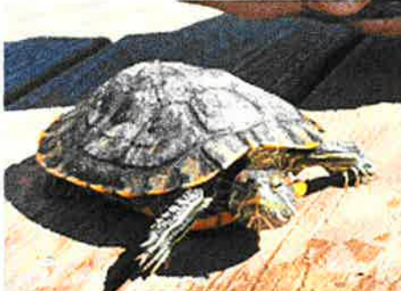
POND SURVIVOR A large tortoise was rescued from a pond in the city center. The tortoise was found by a group of volunteers who were searching for the animal. The tortoise was rescued and taken to a rehabilitation center.