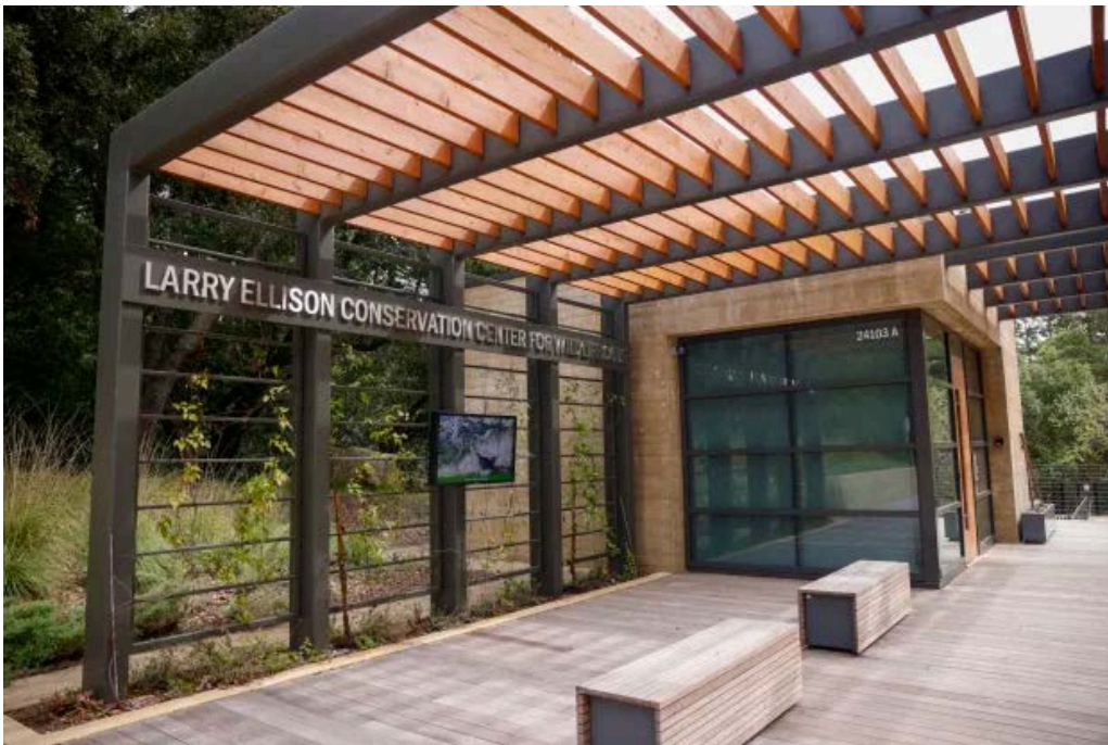
An animal drop off location is open for the public to drop off injured wildlife at the Larry Ellison Conservation Center for Wildlife Care in Saratoga, Calif., on Wednesday, March 19, 2025.