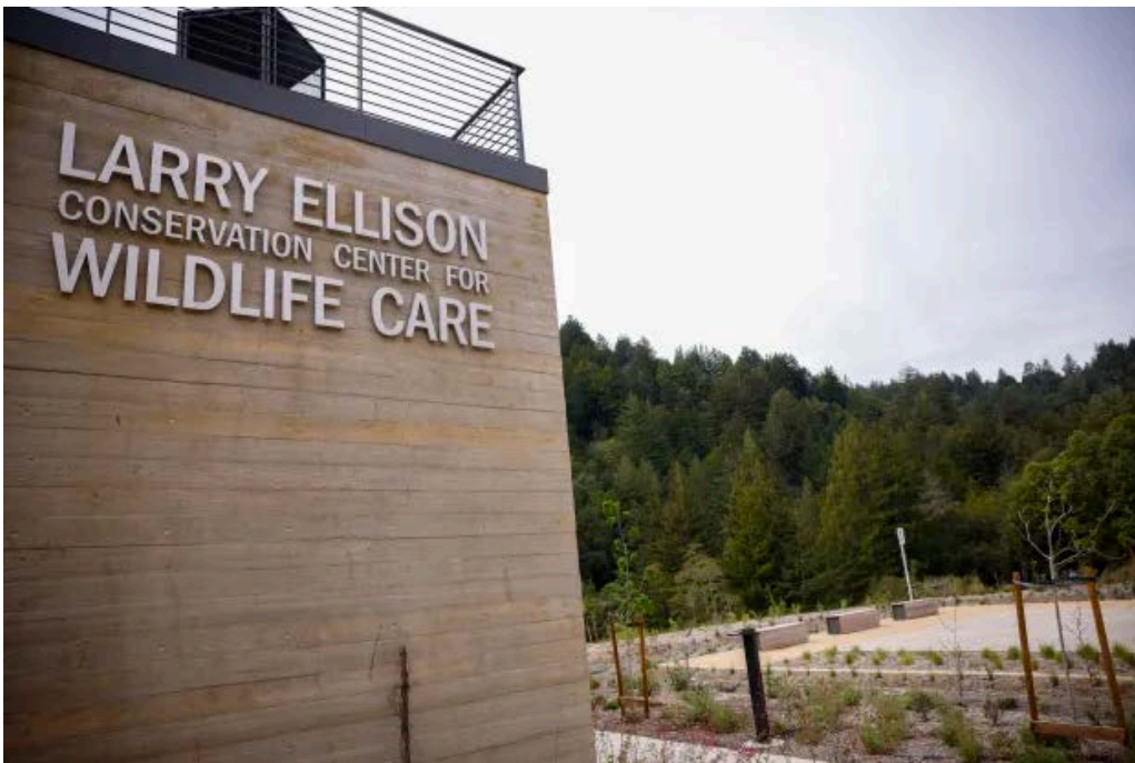
The Larry Ellison Conservation Center for Wildlife Care in Saratoga, Calif., on Wednesday, March 19, 2025.