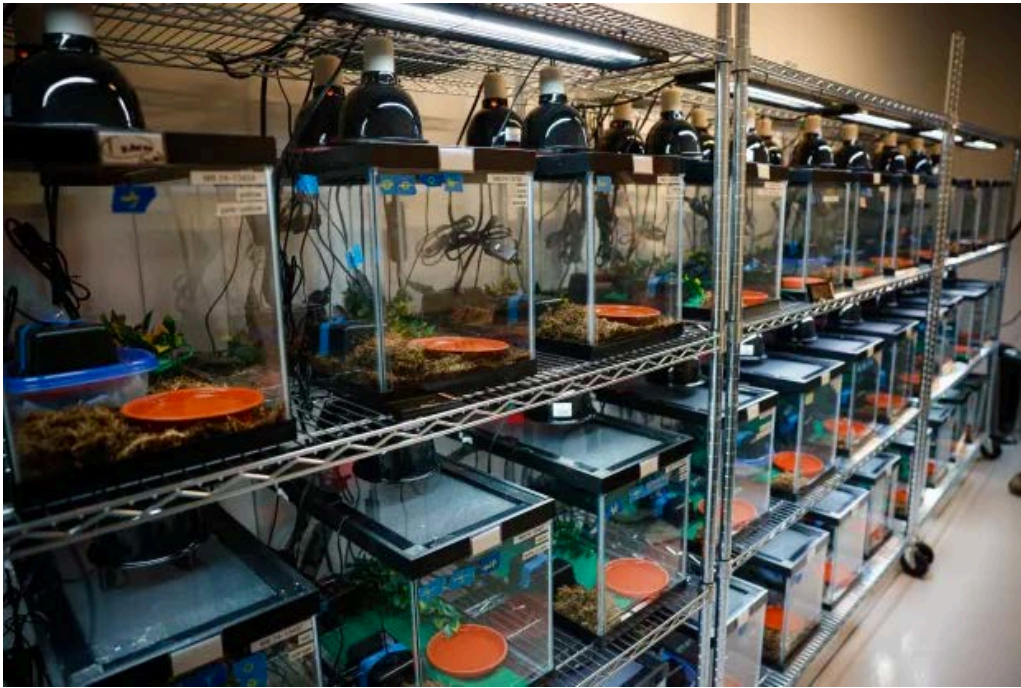
The giant garter snake room at the Larry Ellison Conservation Center in Saratoga, Calif., on Wednesday, March 19, 2025.