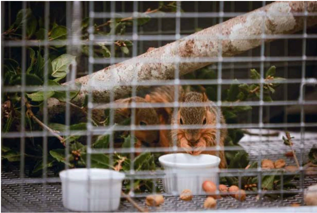
A baby squirrel eats at the Larry Ellison Conservation Center in Saratoga, Calif., on Wednesday, March 19, 2025.