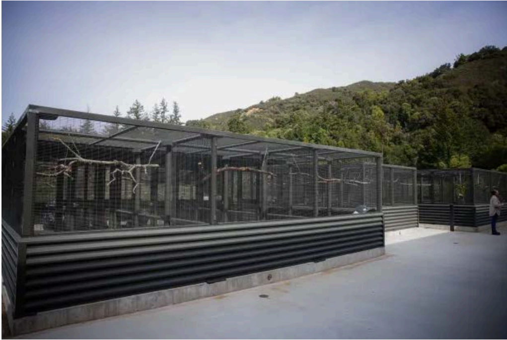
Separate cages allow different species of birds to receive care at the Larry Ellison Conservation Center in Saratoga, Calif., on Wednesday, March 19, 2025.