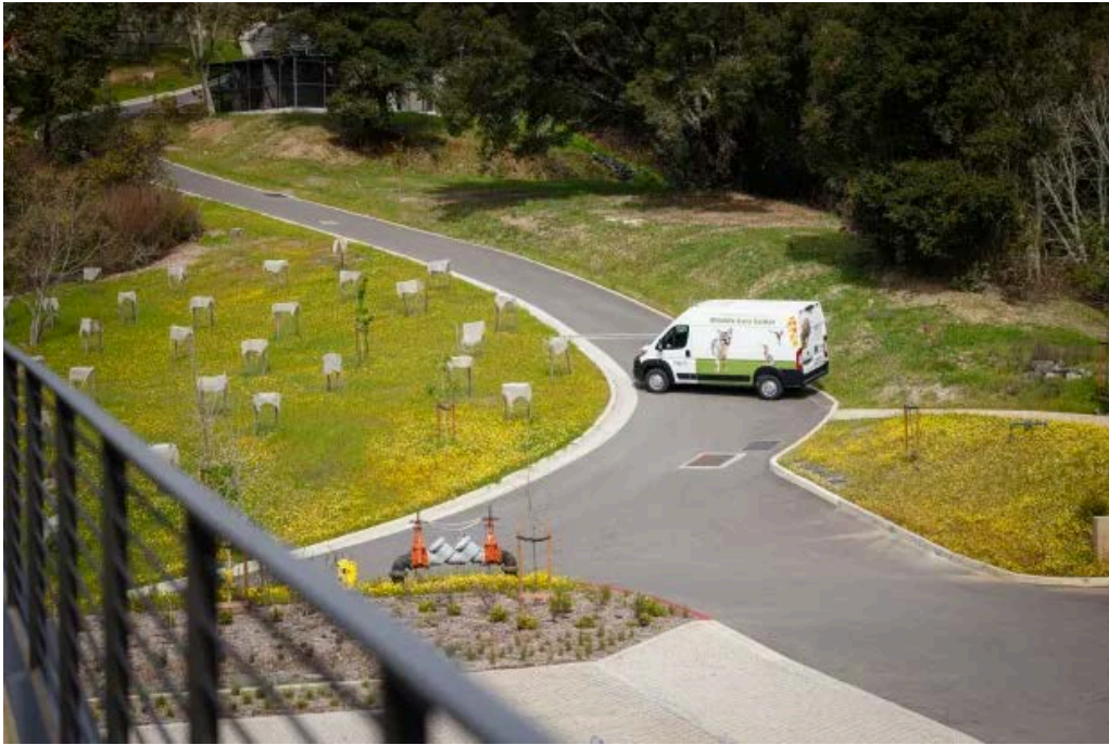
A van is parked at the Larry Ellison Conservation Center in Saratoga, Calif., on Wednesday, March 19, 2025.