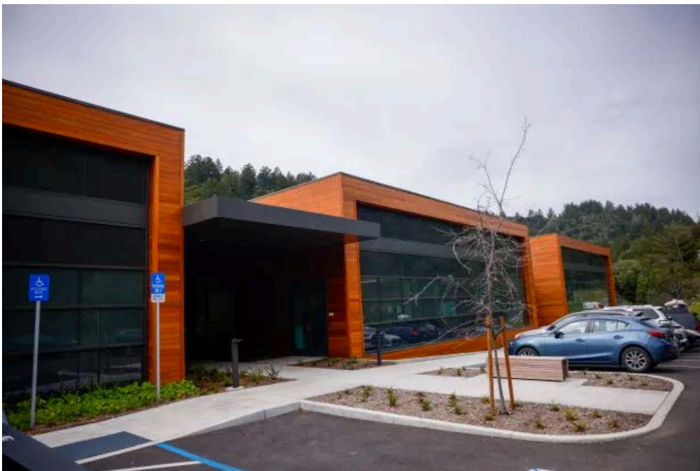
The Larry Ellison Conservation Center for Wildlife Care in Saratoga, Calif., on Wednesday, March 19, 2025.