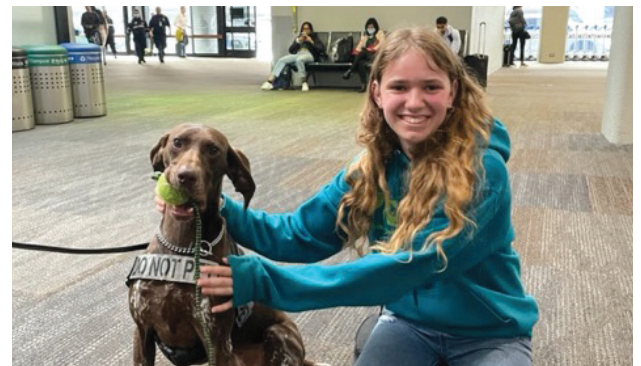
Canine detection dog with a volunteer

And our volunteers enjoyed the experience and knowing they were helping to keep our transport areas safe for everyone.