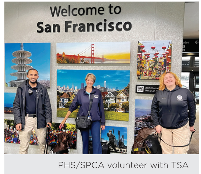
PHS/SPCA volunteer with TSA

To ensure the efficacy of the training session, the identity of our volunteers was never revealed to the dogs or their TSA handlers and there was a rotation of the dogs and their handlers throughout the volunteer shift. These tests are vital to ensuring each of the dogs was still capable of finding the training aid.