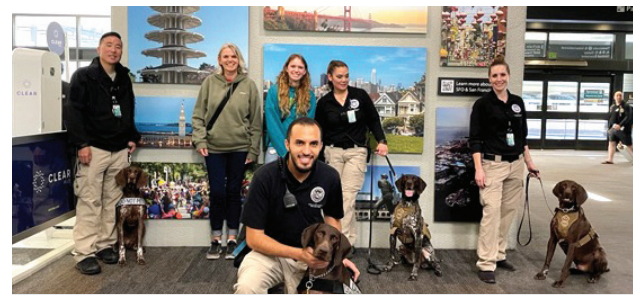
Volunteers at SFO