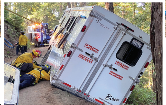
Trailer dangling over the edge

Then the heavy lifting began with the massive tow truck wrenching the horse trailer away from the cliff and back onto the flat dirt road. Our team immediately entered the