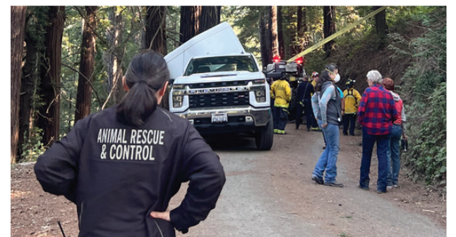
PHS/SPCA to the rescue

trailer, removing the horses to check them for injuries. Thankfully they only suffered minor injuries. The horses happily lapped up much needed water and munched on food.